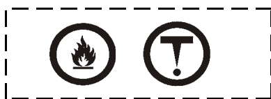
Canadian Hazard Symbols