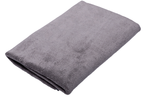
#66306 Eastwood Concours Exterior Microfiber Towel