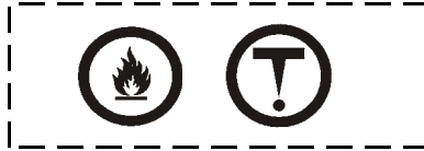
Canadian Hazard Symbols